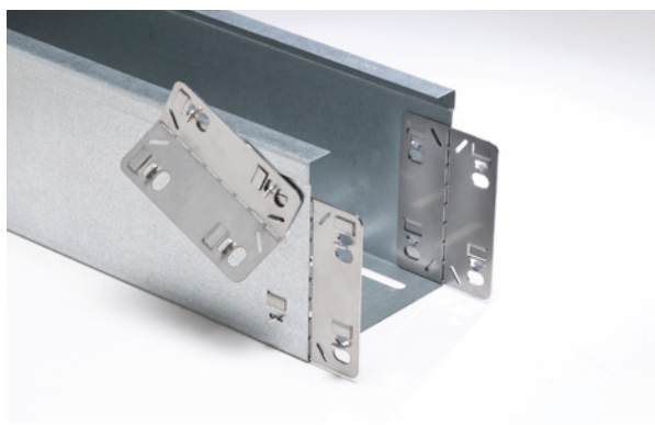
A key feature: the VARIOX® Quick connector is fitted in seconds and can also be used as a tool.

The VARIOX®-Trunking system consists of straight lengths of trunking 2,000 mm long in four cross sections from 100 mm x 100 mm to 300 mm x 100 mm – with either solid or perforated bases. Various 90° accessory fittings, tees, end caps and connectors are also available to match. With a total of only 42 components, the VARIOX® range is designed to be clear, which minimises the cost of ordering, stocking and assembly for the customer.