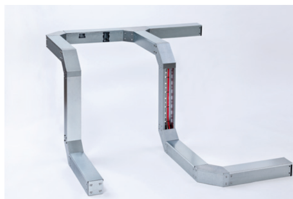
VARiOX® component assemblies – create tailor-made trunking layouts out of fewer different system components.

The whole PFLITSCH range of services as well as tools and machine tools are available as usual for speedy and safe processing of VARIOX®-Trunking. Thus you can be sure you are well equipped for any installation situation and have full flexibility in the design of all your trunking layouts.